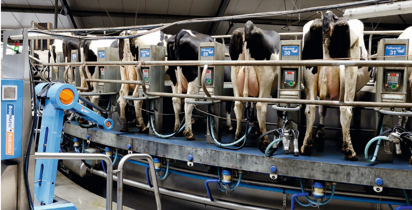
▲ The SR-1 spray robot precisely cleans the udder of the cow straight after milking and prevents the growth of infections. The robot is integrated in the rotary milking system, but functions completely independently.

The milk is continuously analyzed during the milking process. In this way, it is immediately possible to separate any milk that is contaminated with blood. "In addition to this, we have to separate the milk from cows that have been given medicine. Or if a cow has just had a calf, we need the colostrum for it," Ebel Hidding describes some of the factors that have to be taken into account.