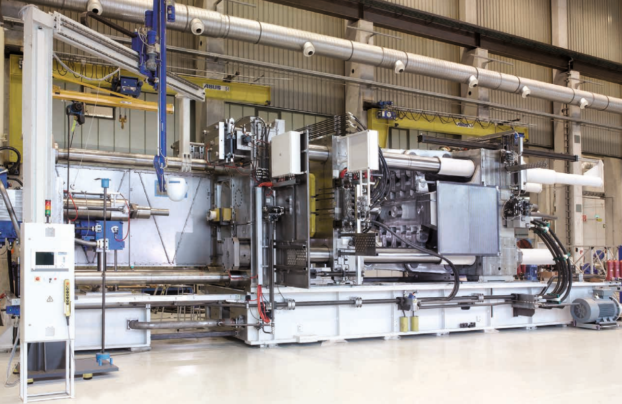
◀ GDK cold chamber die-casting machine from Frech: Up to 5,000 tons (50,000 kN) closing force. (construction in the assembly plant prior to painting.)