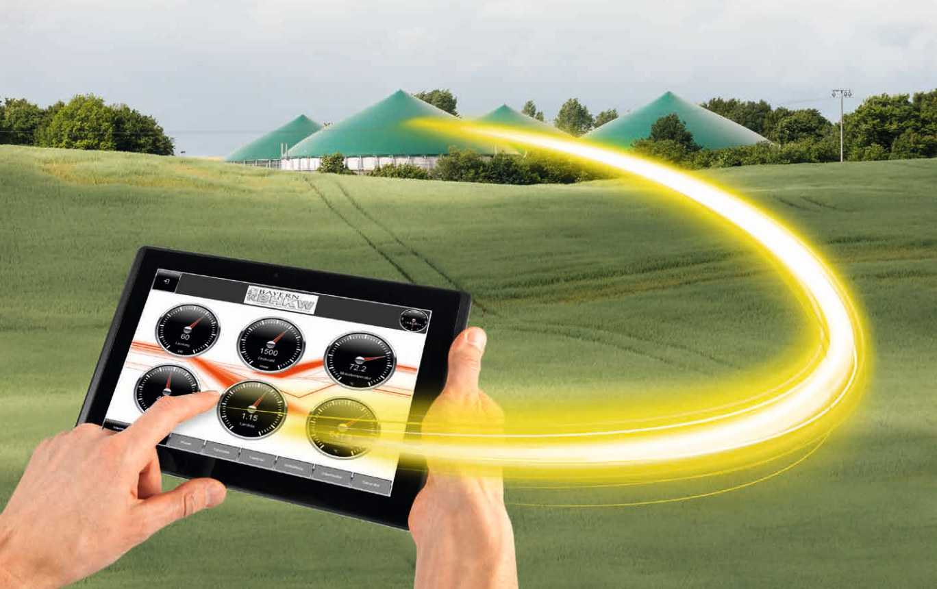
▲ The power plant can be accessed from anywhere in the world.

►► also feed the thermal energy produced into a utility grid and benefit financially from an additional income source.