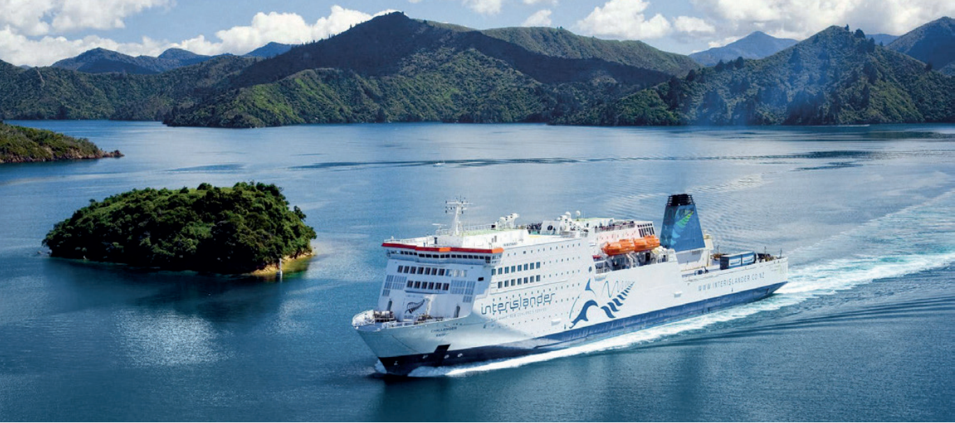
▲ The 182 meter long ferry Kaitaki is the largest of its kind in New Zealand waters. It is equipped with the latest alarm, monitoring and control system from CSI and Bachmann.