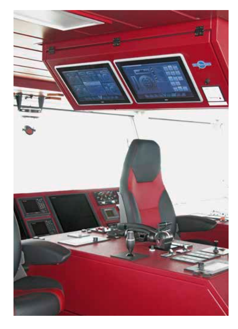
■ The M1 automation system is installed in the engine room where it records all the operating data and any faults. The monitoring can be carried out from the bridge as well as in the engine or propeller room. M1 webMI pro also enables remote access for service and maintenance at any time.

»Voith is impressed by Bachmann's M1 automation system. A reliable hardware and the clear configuration interface for implementing hardware and software projects, as well as extensive diagnostic and analysis options are the outstanding features of the controller package, «Kristian Wege says. Voith's customers also benefit from the short response times required for customizations and the low commissioning costs. The smooth completion of these processes is ensured due to the continuous testing and optimizations during the development phase of the control system.