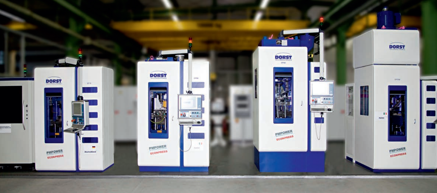
▲ EP series from Dorst: The new generation of servo motor powder presses with a press force of 150 kN up to 1,600 kN.

►► degree of detail as well as the precise status of the application in the event of a fault. This therefore also saves time during programming: “The individual elements of our plants can be assigned easily to the safety functions,” the development manager describes. “Through the use of function blocks, the so-called safety compounds, clean and clear structuring are ensured. The fact that we can use these blocks in different projects and thus implement them quickly in similar machines and plants is of key importance to us.”