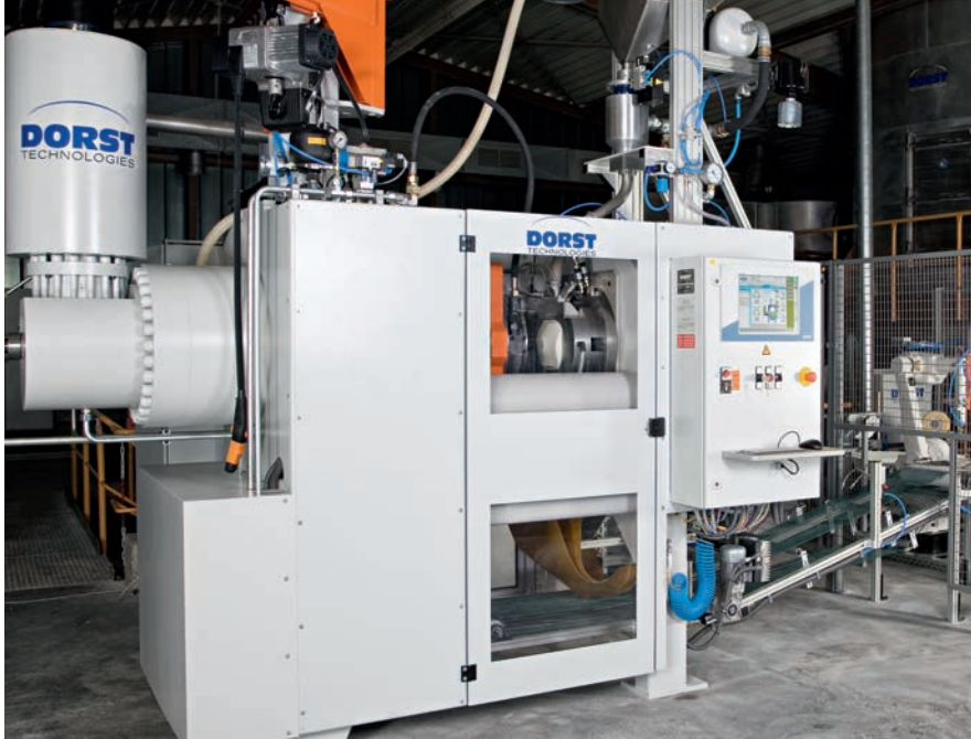
▲ Individual solutions, modular design: Dorst PH 450 isostatic production system with machining stations for the manufacture of flat tableware and bowls with different contours.

The guard doors on these presses are not interlocked but protected by inductive safety switches with SIL3 Performance Level “e”. Besides the optimization of the production process, the safety of man and machine are also given priority: “During operation the system is completely closed. The guard doors can only be opened if the plant is shut down and all axes are in a safe position,” Herbert Gröbl explains. Naturally the machine must also be shut down immediately and with maximum delay when the emergency-stop button is actuated or the process monitoring indicates a critical fault.