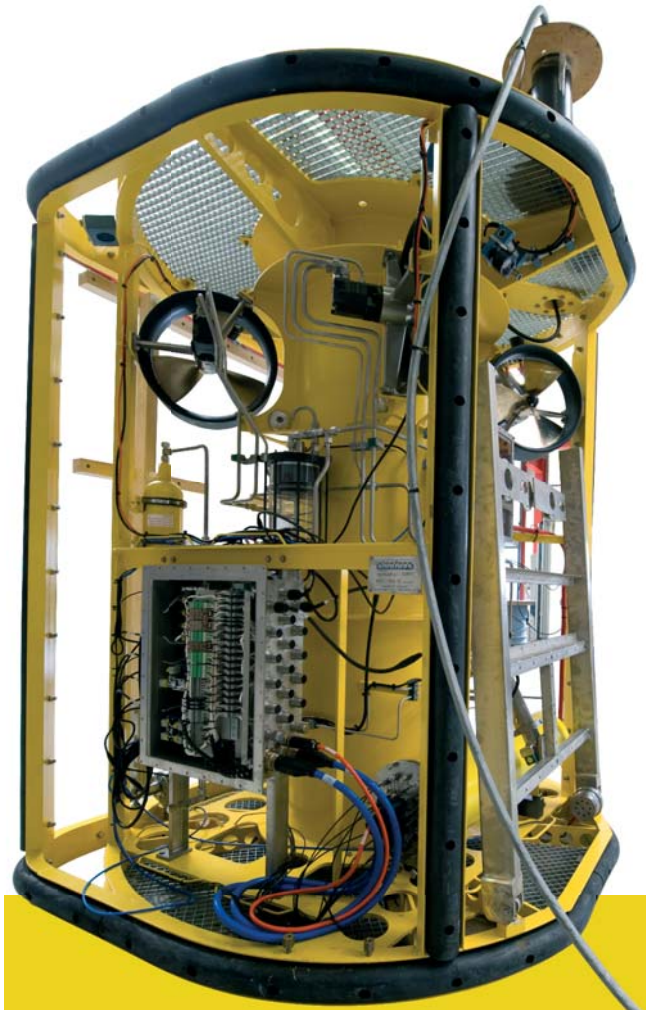
▲ ROV (Remotely Operated Vehicle) for monitoring and controlling stone filling by ships at sea.

»With this development and hardware environment, we can be sure that controller program that functions in the model, behaves as expected on the actual controller,« says the Seatools engineer. The multi-day adjustment work to adapt the system and controller to the actual working and environmental conditions belongs to the past.